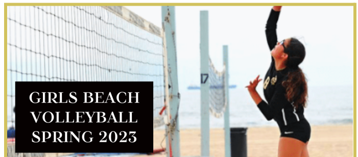
GIRLS BEACH VOLLEYBALL SPRING 2023