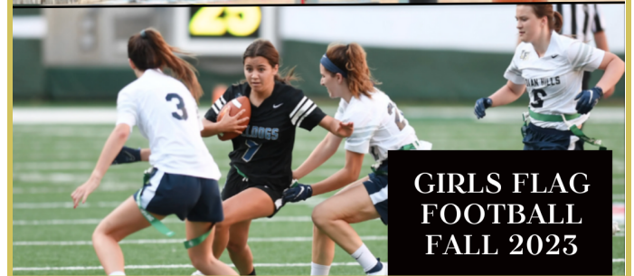
GIRLS FLAG FOOTBALL FALL 2023

California Scholarship Federation (CSF) applications are now being accepted for Spring semester. CSF is an academic, service-oriented organization. Students must have good grades and good citizenship to meet the requirements, based on 1st semester's marks. Freshman, this is the first time you can apply! Seniors, you must reapply to attain Seal Bearer status on your diploma. Please pick up a CSF app from room 603 or 704 that is due 2/24 .